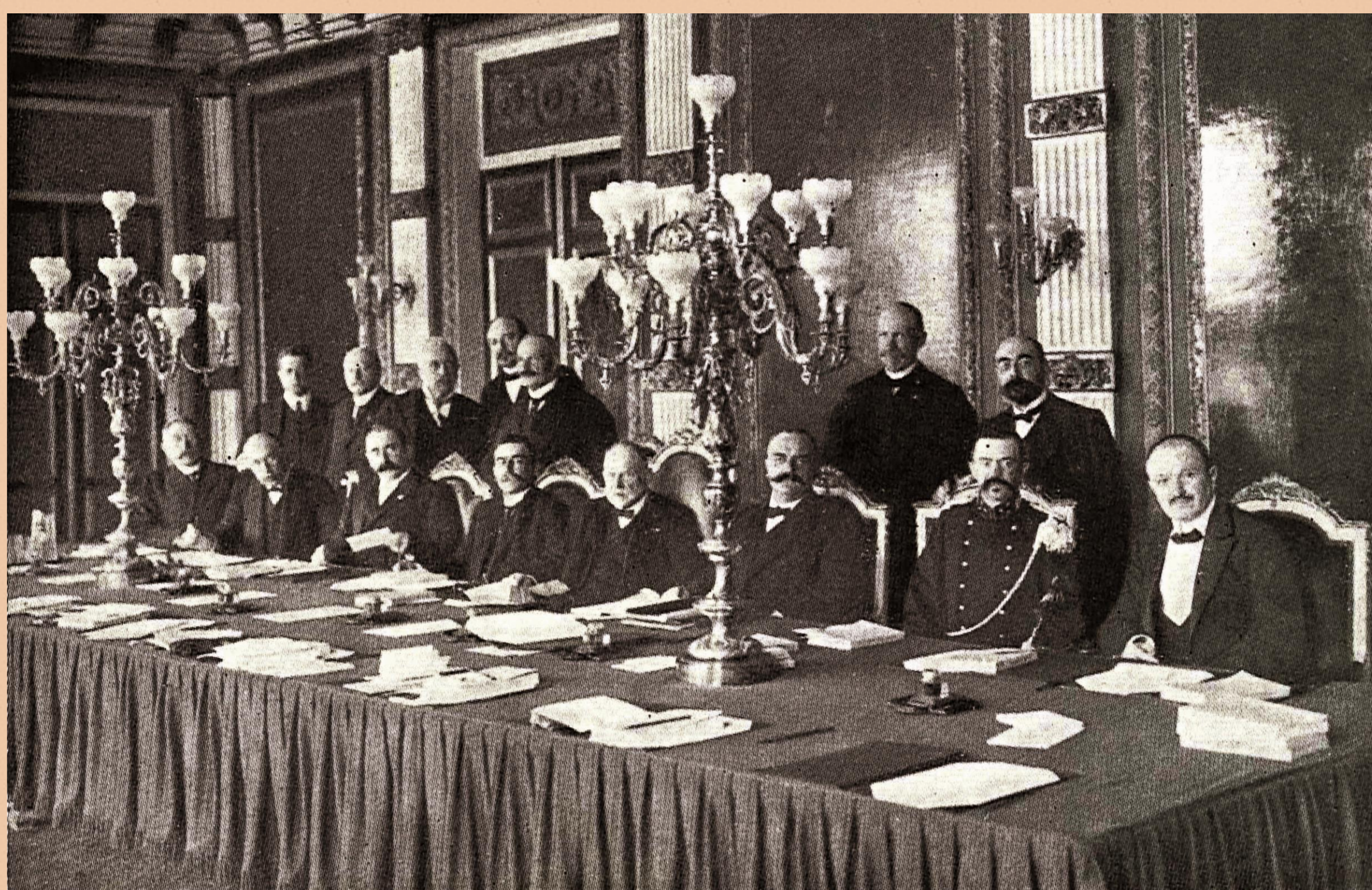
Fig. 1: A photo from the FIP's constituent meeting held on September 25, 1912, in The Hague.