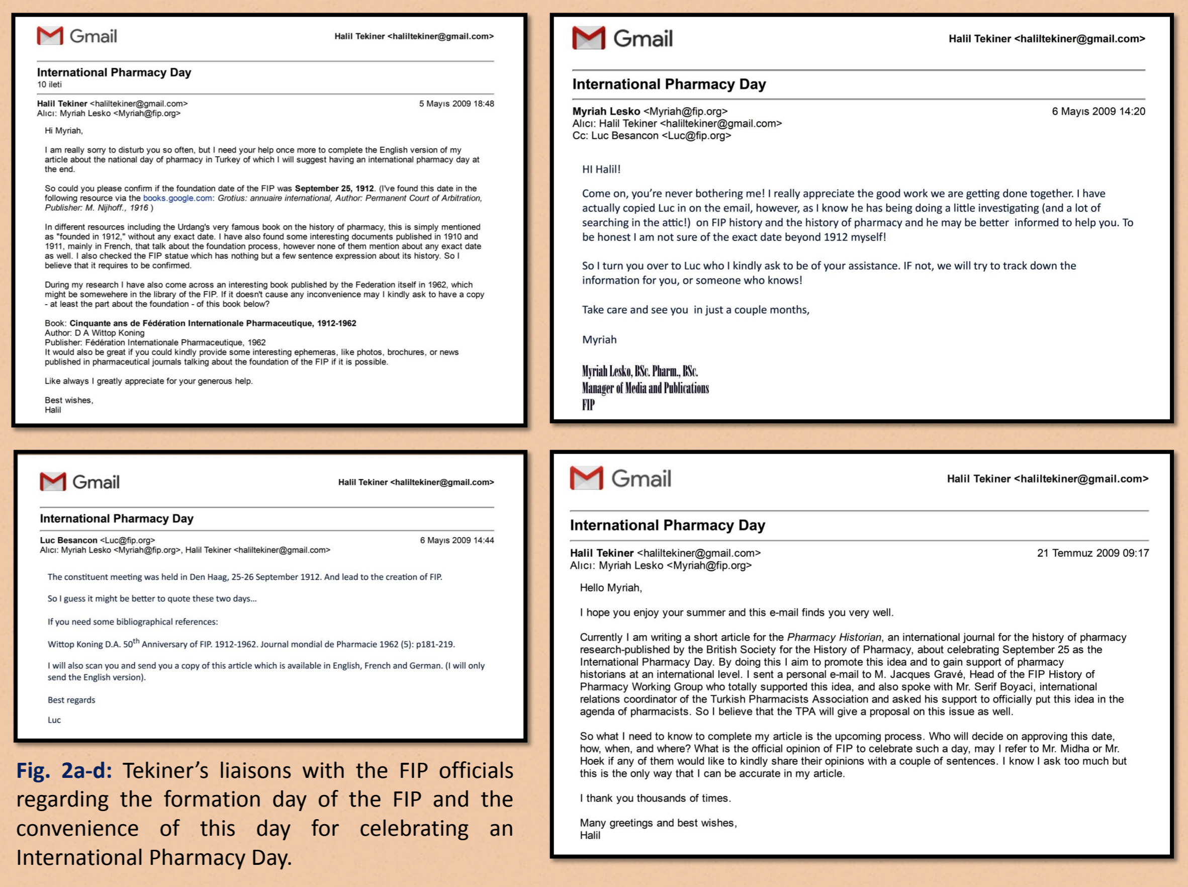
Fig. 2a-d: Tekiner's liaisons with the FIP officials regarding the formation day of the FIP and the convenience of this day for celebrating an International Pharmacy Day.